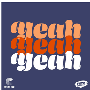
"Yeah Yeah Yeah" (Single - 10.4.24)